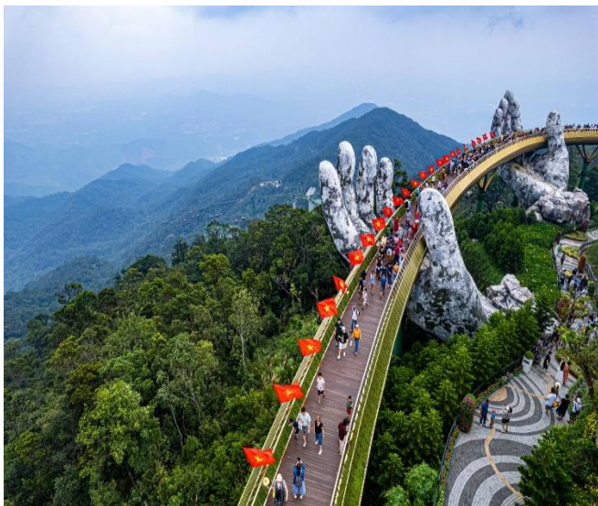
Golden Bridge in Bana Hills

In the morning, transfer to Bana Hills Station. You have a chance to ride on a modern system of cable cars helps you get a bird's-eye view, very miraculous and attractive while enjoying a feeling of flying in the blue sky amidst the clouds and wind. You will visit some old French villas en route, as well as the suspension bridge, Nui Chua & the Mountain Peak (at the height of 1,487m). Visit Linh Ung Pagoda , Golden Bridge , Sakyamuni Buddha's monument and Ba Na .