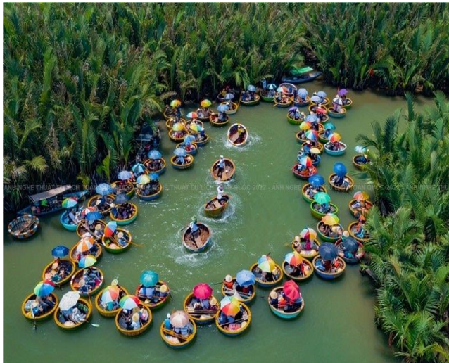
Cam Thanh Coconut Boat Trip

Meals Breakfast at hotel Lunch and dinner at Vietnamese restaurant