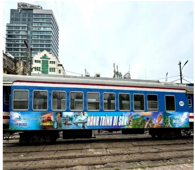
Connecting Central Heritage train