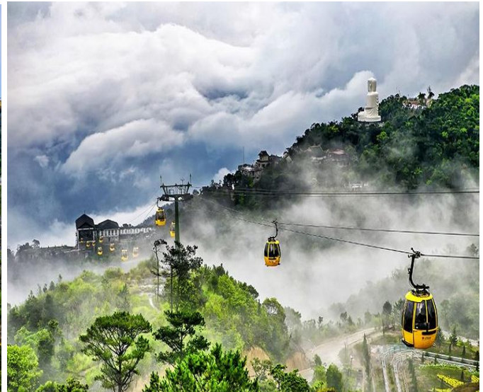
Ba Na Hills Cable Car