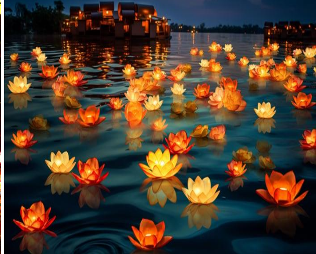
Floating blessing candle