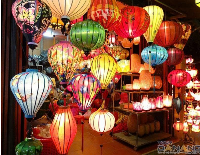
Hoian Ancient Town