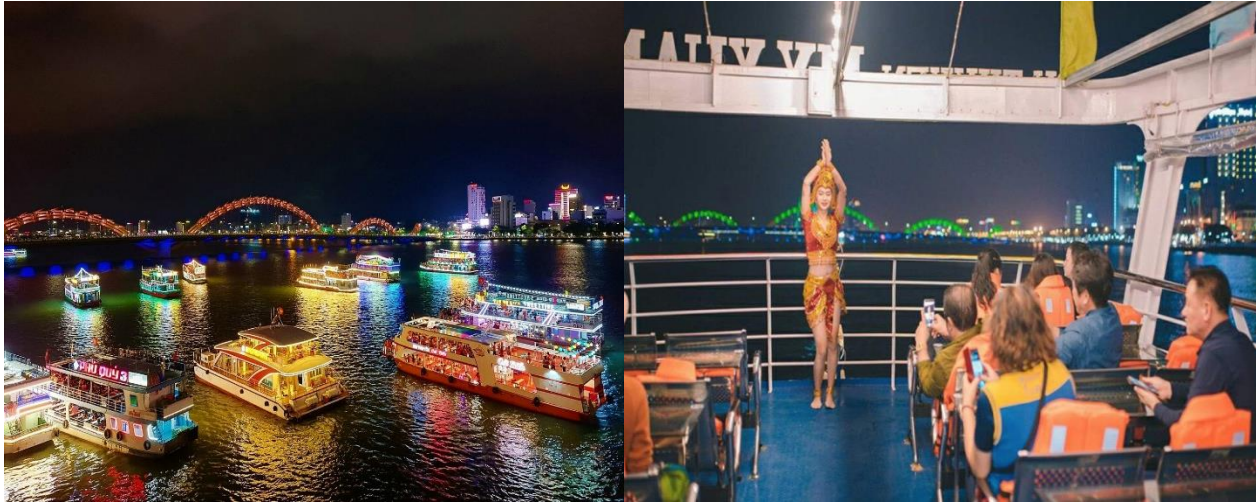
Han River Cruise Tour with Cham show

Then enjoy Han River Cruise Tour Da Nang