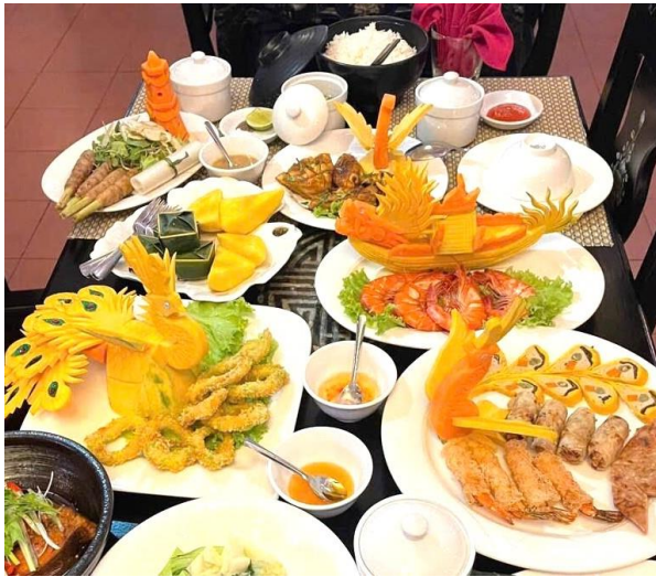
Hue Royal Meal

Note: 10 pax up confirmed will have Hue's court music show