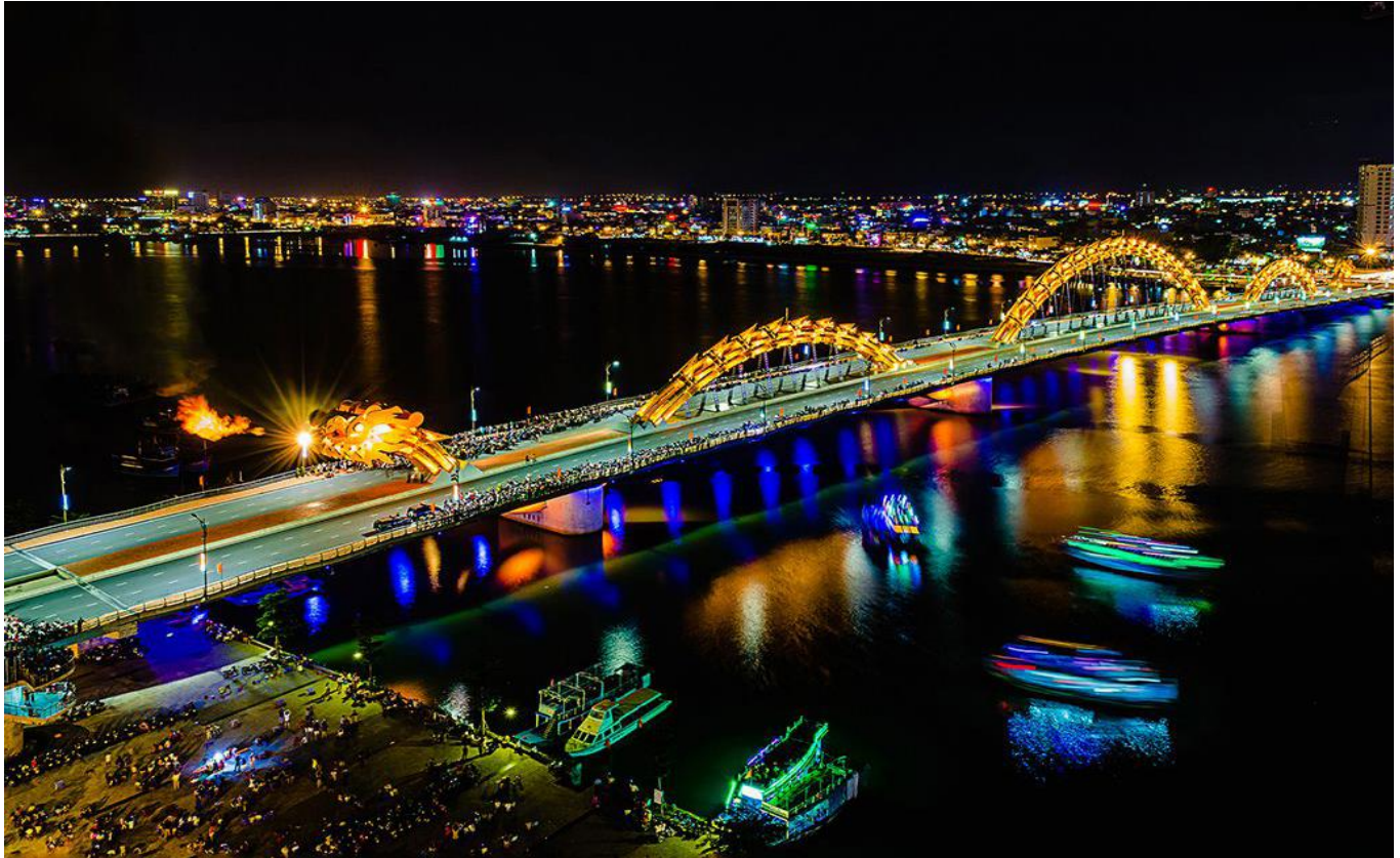
Dragon Bridge - Danang

Central Vietnam is where Da Nang is situated. It is ideally located for travel from both the North and the South, being in the center of the nation with many attractions such as: Bana Hills, Dragon bridge, Han market, My Khe beach etc . Beside that, visitor also have the chance to visit Hoian - A small town which is situated on the bank of Thu Bon river, Cam Thanh coconut forest with experience boat trip. Finally is Hue - A city steeped in history and culture, nestled along the banks of the Perfume River and is renowned for its stunning architectural marvels, lush landscapes, and rich traditions.